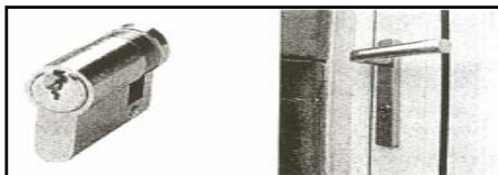
(A typical euro-cylinder door lock)