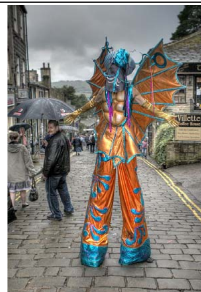
“Stilt Walking Firefly” Chicks on Sticks perform at last year's festival